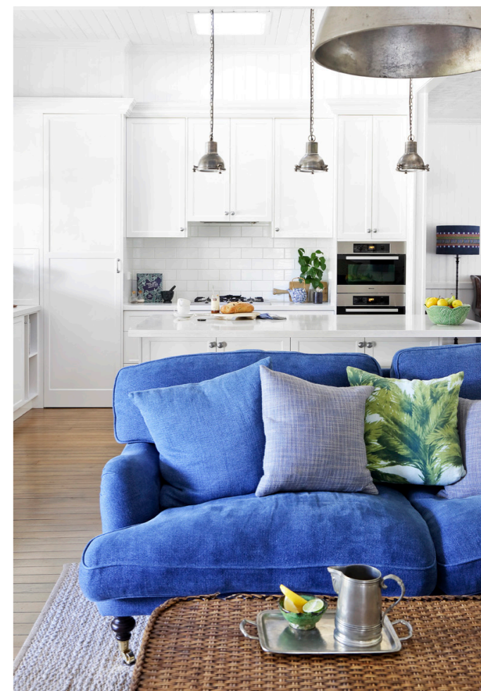
ARTWORK (THIS PAGE, TOP RIGHT): BEADLES

A wall was removed to create a more family-friendly flow through the living, kitchen and dining zones. Angela had the plush custom Colby Furniture couch (right) covered in a bolt of bright blue fabric, while a rattan chest from Angela Smith Interiors doubles as a stylish and durable coffee table. >